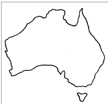
Fig 39. Small scale chart 1:5, 000, 000.

If you try and fit in a small area into the same sized piece of paper, you will produce a “Large scale chart”, such as a TAC, or VTC chart. (1:250, 000). Refer fig 40 below.